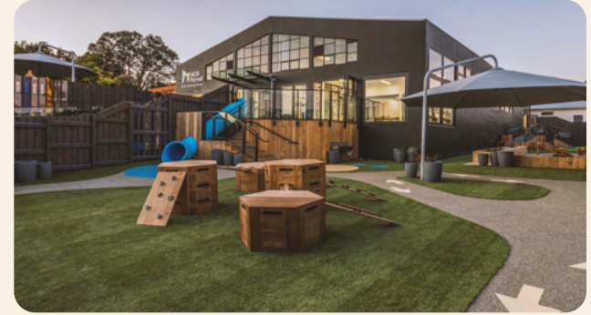
ACG Parnell ELC