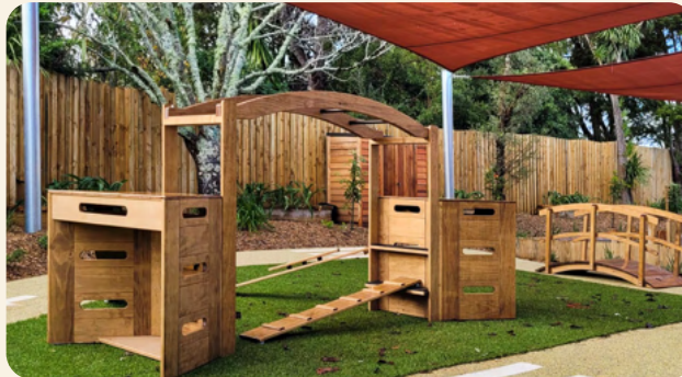
Just Kids Beachlands