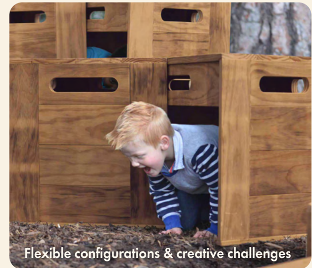
Flexible configurations & creative challenges

All Outdorable® play equipment is safety certified for supervised ECE when used accordingly to our user's handbook.