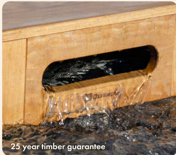
25 year timber guarantee

View our full range online at outdorable.com/outdorable-play-equipment/