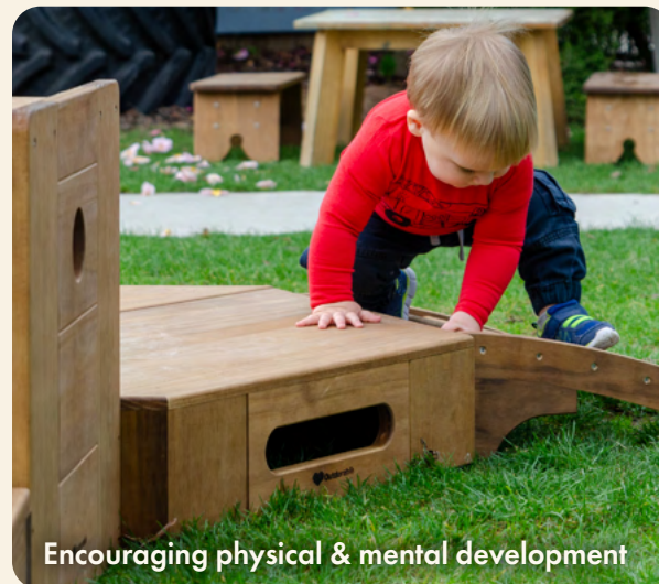
Encouraging physical & mental development

Our timber holds all the eco-labels you could ever wish for. Certified: Cradle to Cradle gold level, FSC®, BREEAM and LEED.