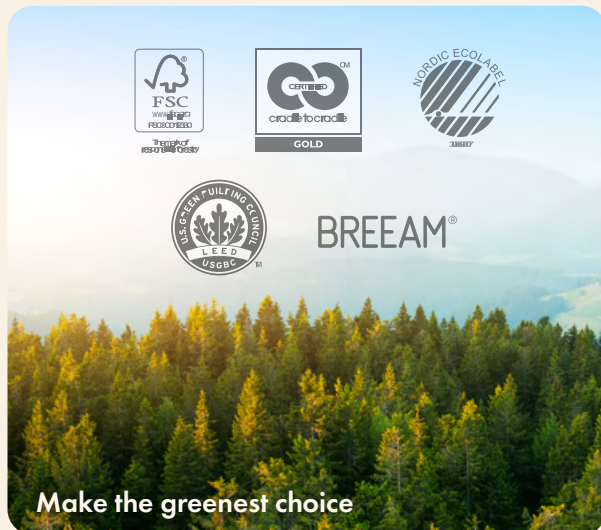
Make the greenest choice

Movable play inspires boundless configuration ideas. Create tunnels, hide-outs, bridges, boats and more with our modular Beaverlodge climbers.