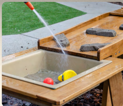
Easy clean up.