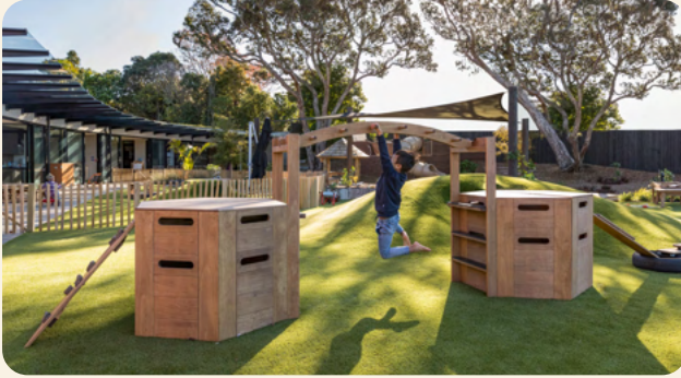
Campbells Bay ELC