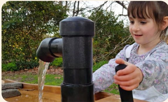
Recirculating water pump that's hand powered by the children for the most popular water play experience ever.