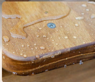
Smooth rounded bevel edges.