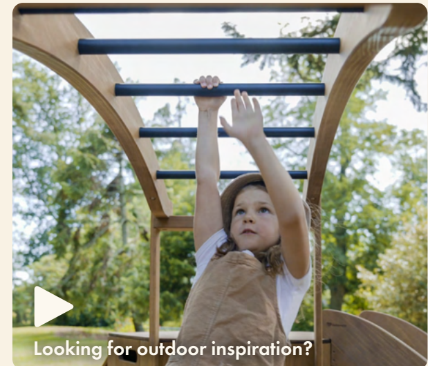
Looking for outdoor inspiration?

Stimulates imaginative play, gross motor skills using upper and lower body strength, hand-eye coordination, balance and spatial awareness.