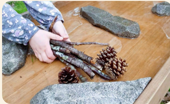
Recycled river rock water diverters for added water play experience. Looks and feels just like real rock.