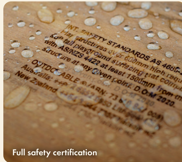
Full safety certification

Outdorable® weatherproof timber is guaranteed for 25 years not to twist, shrink, warp or rot! It lasts for good - naturally.