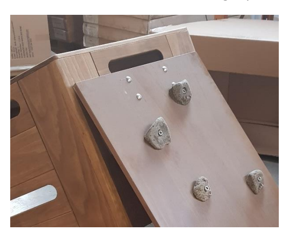
STEP 1: Tilt the 600mm climber slightly backwards and insert the climbing wall brackets.

As the rock climbing wall is best suited for the 860mm climber, it has the steel brackets set to fit this height climber snuggly. To fit this rock climbing wall to the lower 600mm climber, simply follow these steps.