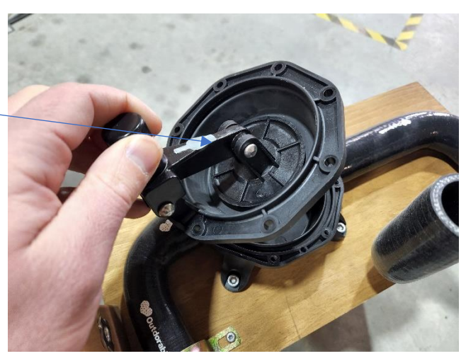
STEP 5: Remove the centre screw holding the flange on.

Replace flange and put back together ensuring all screws are tight