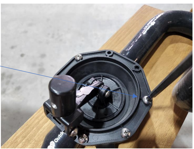
STEP 6: Remove the flange housing from the pump.