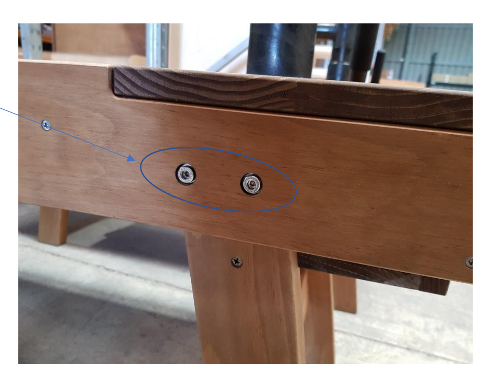
STEP 2: Remove the pump lever but taking out the little screws – can be a bit fiddly. :)

STEP 1: Remove the 2 HEX bolts holding the back legs onto the table. (repeat on both back legs)